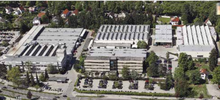
Stammwerk Allgäuer Straße