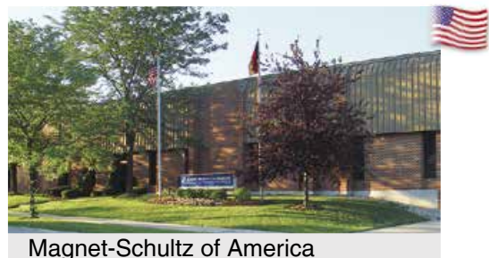
Magnet-Schultz of America